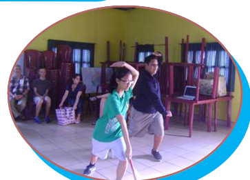
Teaching Asian dance