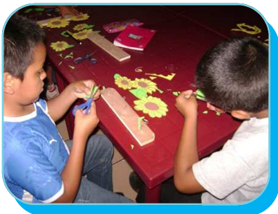
Making crafts for Mother's day