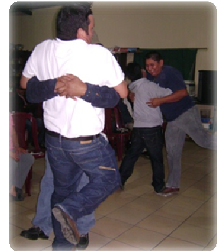
Fathers participating in a contest