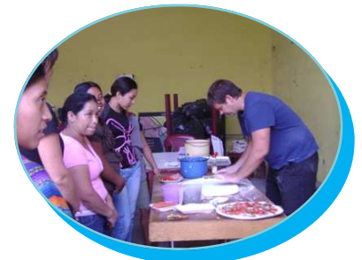
Learning how to make pizza