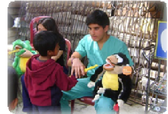
Teaching how to take care of teeth