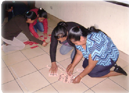
Participating in contests