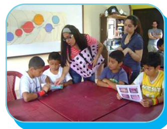
Doing activities with the children

At Open Windows, we offer different kinds of volunteer work, and the children always appreciate learning from the foreigners who visit us.