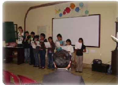
Children singing and playing the flute on Father's day