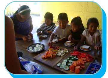
Children making salads