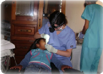
Doing a dental cleaning