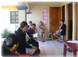
Waiting for glucose check