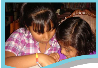
Reading and educational games

Thanks to the support of many people who have donated, and to the volunteers who have shared their work, abilities, and knowledge with the children, we have been able to continue with these programs.