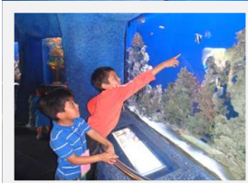
Recognizing different fish!

This year, we once again took a group of 104 children to visit the zoo. Then, they went to see the relief map of the country, where they learned about the history and geography and distinguished places they knew and admired places they hadn't even imagined. During the visit to the zoo, they learned about penguins and learned about aquariums, as well as learning about other animals. Afterwards, they enjoyed a tasty lunch.