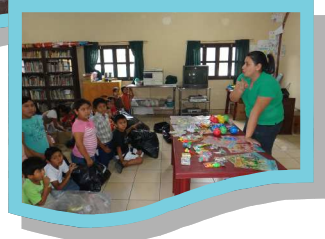
Gathering and recycling!