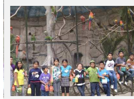
Learning about birds!

During the visit to the zoo, they learned about penguins and learned about aquariums, as well as learning about other animals. Afterwards, they enjoyed a tasty lunch.