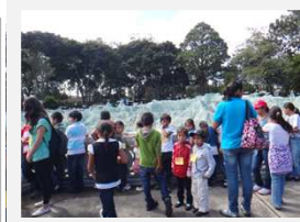
In the relief map!