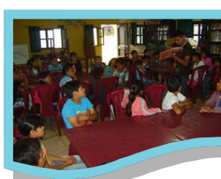
Reading time activity