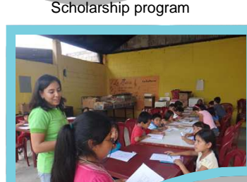
Writing, reading & Math Reinforcement