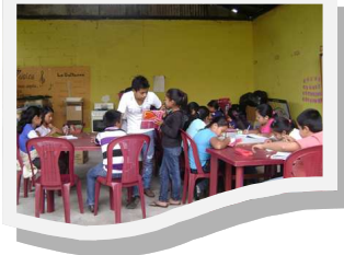
In tutoring and homework help classes!

For 150 elementary school children, we provided reading, writing, and math tutoring. All of these children and others who weren't in tutoring attended computer classes at different times of the morning and afternoon. The classes were prepared and given by the teachers and the scholarship students helped.