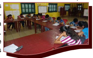
Workshop for scholarship students